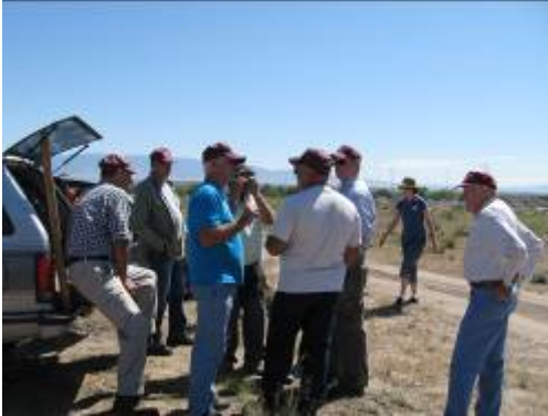
September Monthly Hunt-Belen Dump