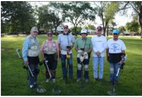
August Special Hunt