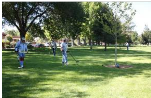
September Special Hunt