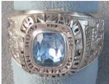
Class Ring 10K