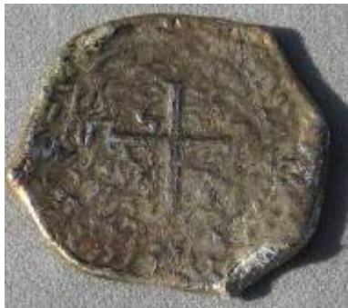
Gold Reale Replica