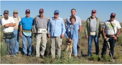
September Monthly Hunt-Belen Dump