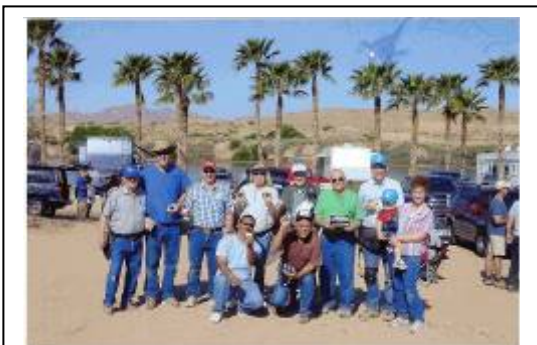
FMDAC Hunt –Laughlin, Nev. 2005

Club Members were on a monthly hunt in January 2003 at Elephant Butt Lake when a Park Employee told the club members that they could not hunt on the beach. He said a law had been past in January 2003 that disallowed metal detecting at all New Mexico State Parks. This was a big disappointment for our hobby and club. Some of our members had found some great finds at Elephant Butt Lake. We had an over night trip there in 2000 when one of our members found a chain & kept digging and digging and eventually found an anchor attached to the chain. What a great find on the beach that day!