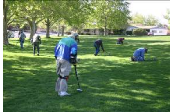
April Special Hunt