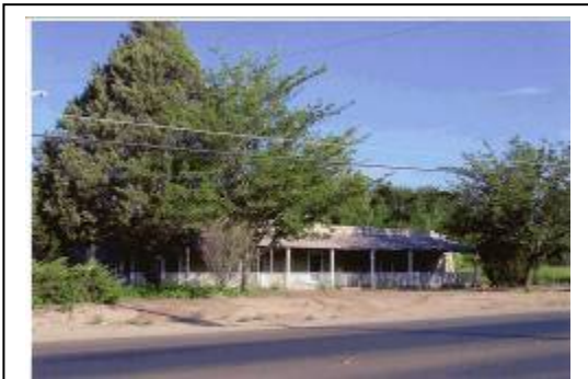
Hubbell House Before

Instead of writing about a member in our club this month, we have decided to write about our club “The Albuquerque Metal Detector Association known as AMDA” . AMDA was formed in the 1980s to provide fellowship among all members, to be of service to the community, (including law enforcement agencies and historical societies) and the preserving of historic data. Our club promotes friendship, fun, and expertise through organized metal detecting activities, special events, and sharing treasure-hunting experiences.