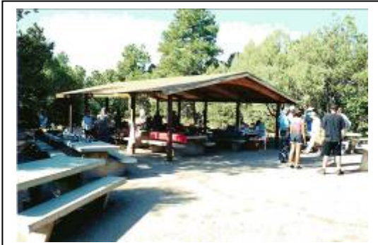
Annual Hunt Picnic

featuring all the people enjoying the great weather being outdoors. We had one member in the news returning a UNM 1978 WAC Basketball Championship ring to the owner in February 1997. In August 2005, the West Side Edition of the Albuquerque Journal did an article on our club writing about what a great hobby metal detecting is and what we give back to the community.