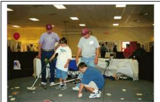
State Fair Booth in 2000