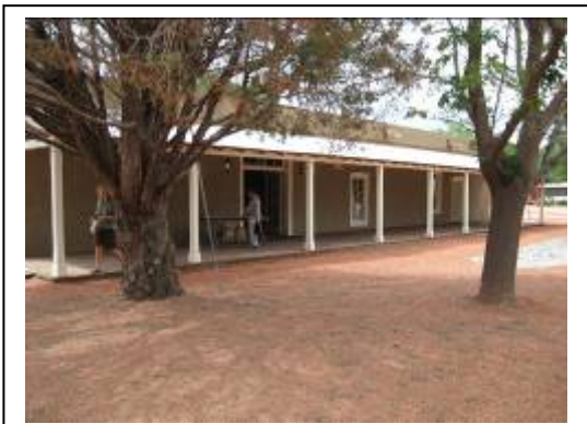
Hubbell House after the renovations