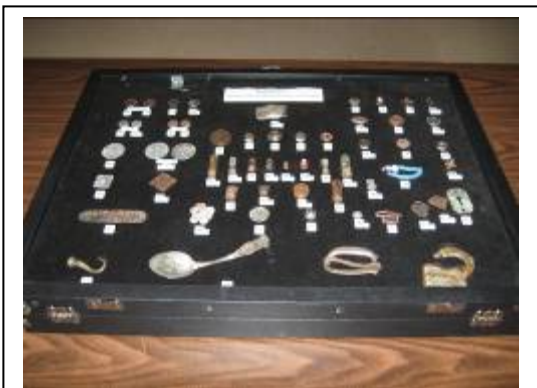
AMDA Display at The Hubbell House