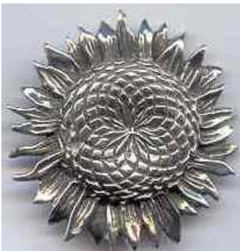
Sterling Silver Sunflower Pin Found by Jim Westmoreland