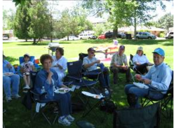
Special Hunt Picnic