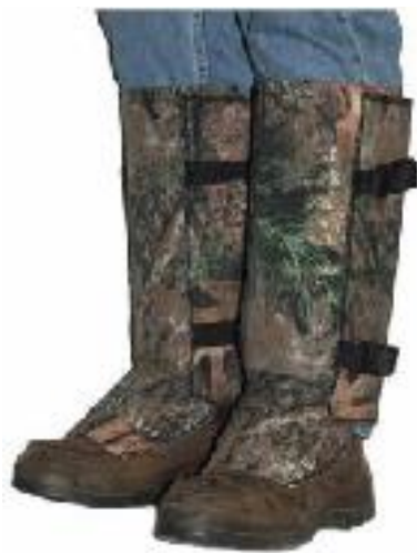
Snake Guardz™ / Gaiters