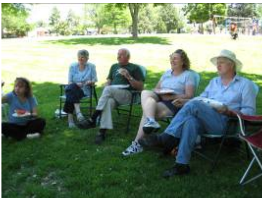
Special Hunt Picnic