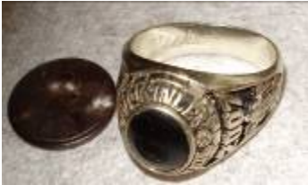
Class Ring returned to Isaah.