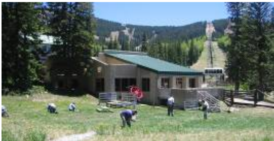
Peter's Rally Santa Fe Ski Area