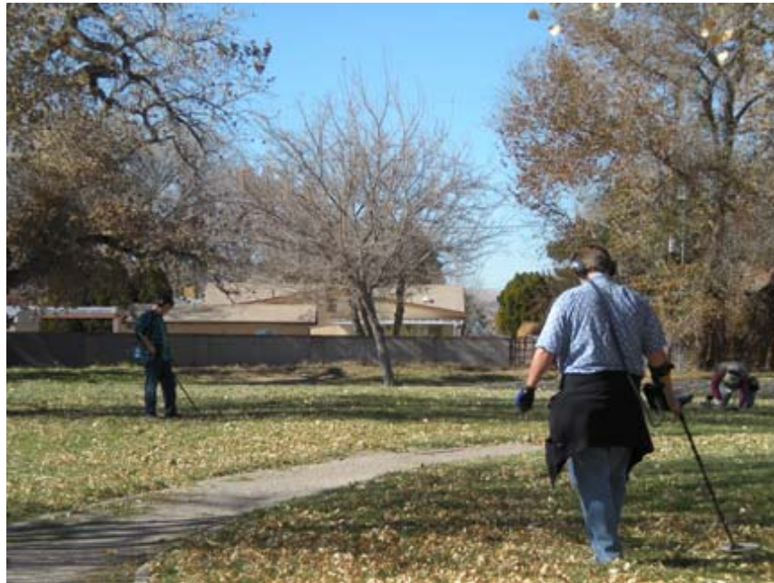
The fair weather of December has turned to ice and snow.