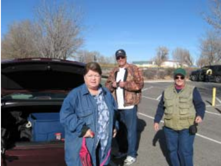
Mariposa Park Hunters in January