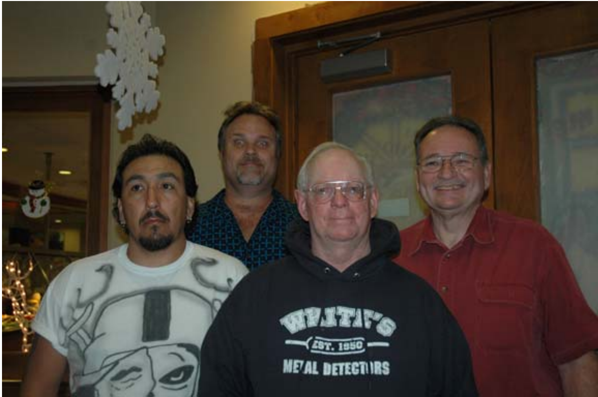
Officers for 2011